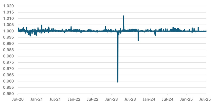
Chart 3: Stablecoins have not always been stable USD Circle stablecoin to USD

The passage of the GENIUS Act in our view marks a seminal moment in financial history—when crypto, long relegated to the fringes of finance, was formally welcomed into the regulatory and institutional mainstream. By creating a legal framework for stablecoins, the Act effectively acknowledges them as a parallel and potentially superior—form of digital cash. Yet, with this acceptance comes a paradox: not all dollars will be equal. As regulated, fully reserved stablecoins become tradable across financial systems, they may command a premium over both physical dollars and lesser stablecoins, reflecting perceived safety, liquidity, and legal clarity. Conversely, unregulated or offshore - issued tokens could trade at discounts, penalised by market distrust or limited usability. This new landscape blurs the once sacrosanct 1:1 peg, and in doing so, challenges the very notion of money as a uniform unit of account. For the first time since Bretton Woods in 1944, we are witnessing a market-driven repricing of trust in the dollar, one token at a time.