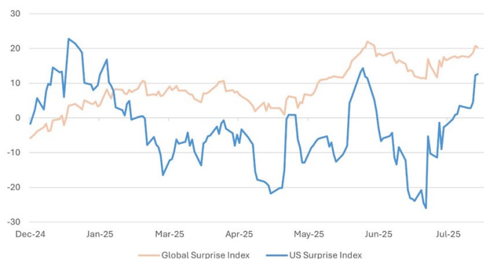
Chart 1: Citigroup US Economic Surprise Index on the Rise Index

Global economic data had been outpacing the US, but strong retail numbers and a bounce in manufacturing helped narrow that gap and propelled the Citigroup US Economic Surprise Index (CESI) into positive territory again. The tone has brightened, just in time for the next policy twist.